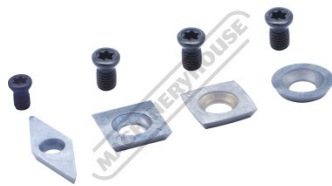
Replaceable Carbide Tips