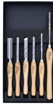
Top View In Case