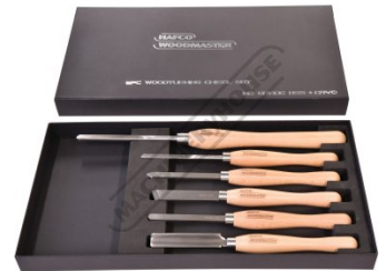
Box Packaging Open