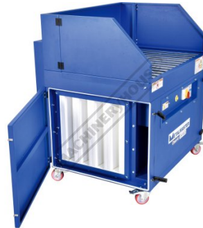
Filter door open