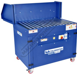
Side doors open