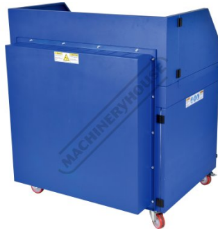
Rear Upwards Return Air Vent