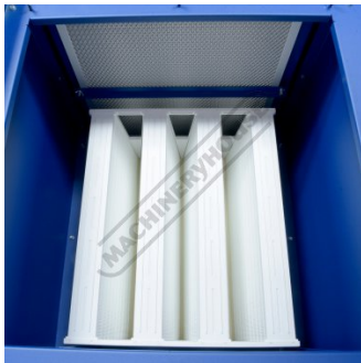
H13 Hepa Filter Assembly