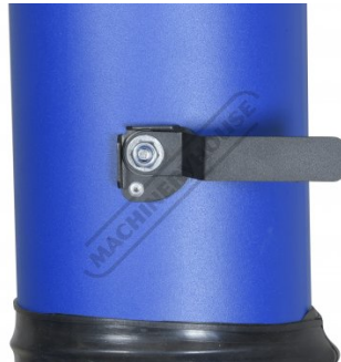
Air Flow Control Valve