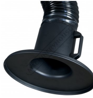
Fume Extraction Head