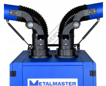
Dual Exo Joint with Gas Strut Supports