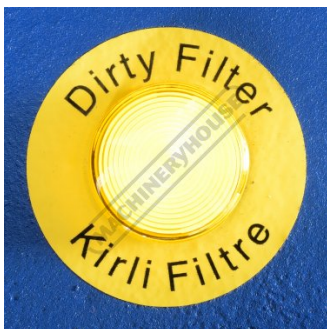
Dirty Filter Light Indicator