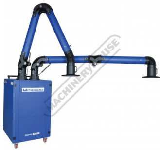
3 Metre Arm Extended