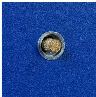
Inlet Spark Arrestor