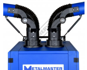
Dual Exo Joint with Gas Strut Supports