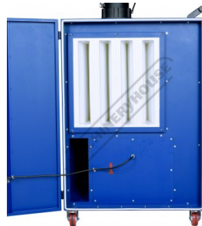
Left Side Door Access Panel