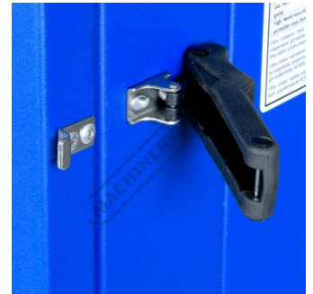
Quick Action Door Panel Locks