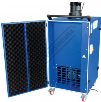
Rear Door Access Panel