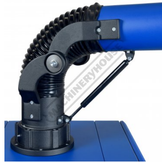
Exo Joint With Gas Strut Support