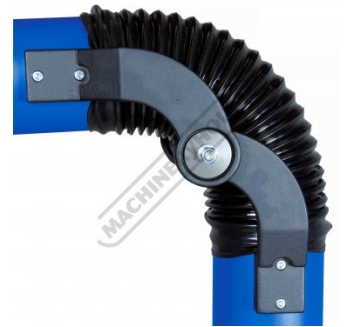
Exo Centre Arm Joint