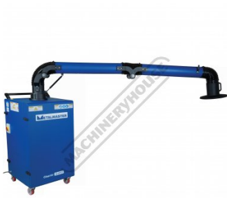
3 Metre Arm Extended