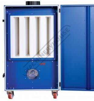
Front Door Access Panel