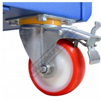
2 x Swivel Wheels with Brake