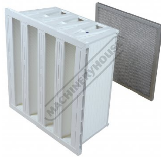
Dual Stage Filter System