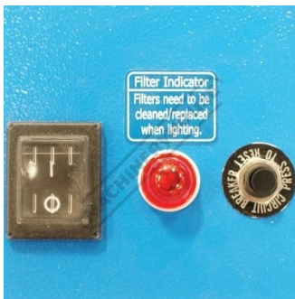
Filter replacement Indicator