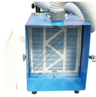
Easy Access to Filter