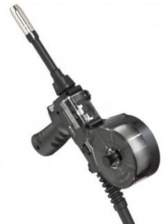
W181C Spool Gun - Light Duty