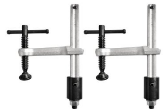
W08512 Weld Clamps with Locking Nuts (2 Piece Pack)