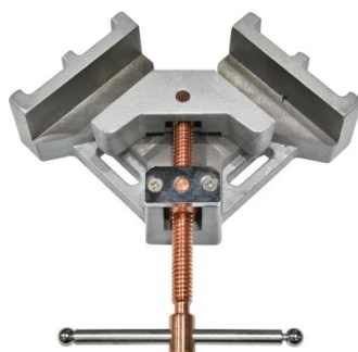
V099 90 degree Angle Vice Clamp