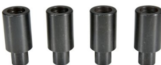
W08515 38mm x M12 Multi-Purpose Riser/Stops (Spigot Type) - 4pc Pack