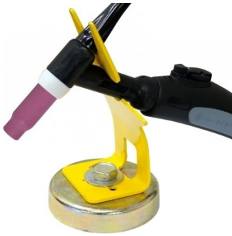
W10361 Magnetic TIG Torch Rest