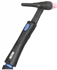
W171C Air Cooled Arc Torchology® TIG Welding Torch