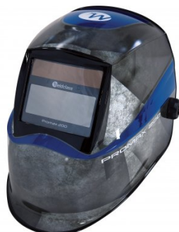
W001 Auto Darken Welding Helmet - 9-13 Shade