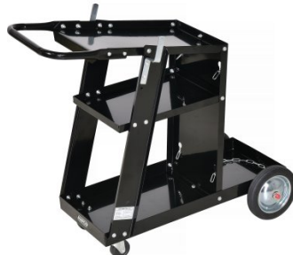
W241 Universal Welder Trolley