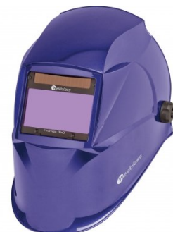
W002 Auto Darken Welding Helmet - 9-13 Shade