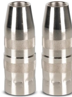
W5015 M350 Conical Insulated Gas Nozzles