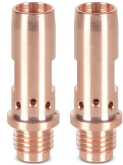
W5017 M350 Tip Adapter