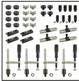
W08500 40pc Square & Round Welding Table Clamp Kit