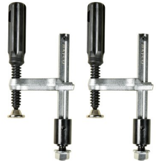
W08510 Weld Clamps with Locking Nuts (2 Piece Pack)