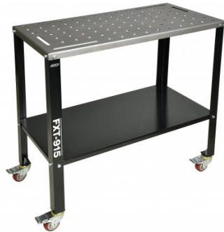
W08450 FIXTURE TABLE