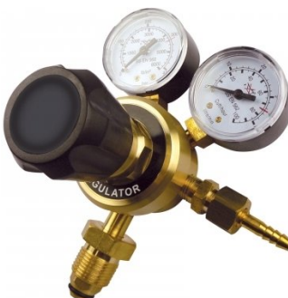
W1140D Argon Gas Regulator-Twin Gauge