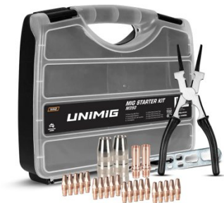
W501A M350 MIG Torch Consumables Starter Kit