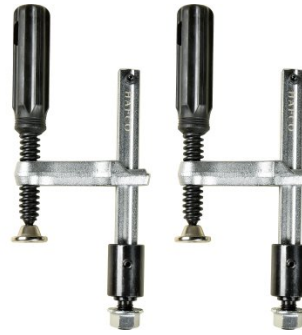
W08510 Weld Clamps with Locking Nuts (2 Piece Pack)