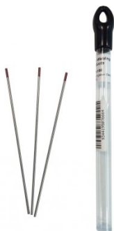
W1142V 2.4m Tig Tungsten Electrode - Thoriated Red