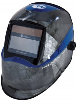
W001 Auto Darken Welding Helmet - 9-13 Shade