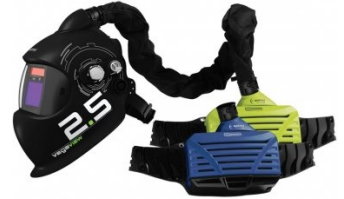
W1092 Auto Darken Welding Helmet with PAPR Respiratory System - (2.5) 8 ~ 12 Shade