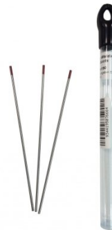
W1142V 2.4m Tig Tungsten Electrode - Thoriated Red