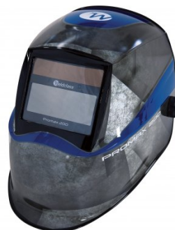
W001 Auto Darken Welding Helmet - 9~13 Shade