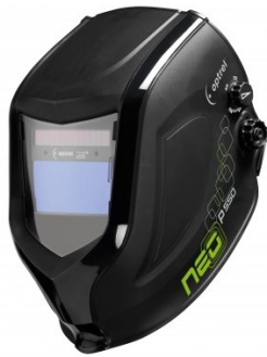
W1090 Auto Darken Welding Helmet - 9 ~ 13 Shade