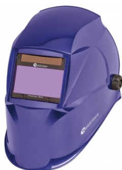
W002 Auto Darken Welding Helmet - 9~13 Shade