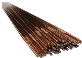
W1142A Ø2.4mm TIG Filler Rod - Mild Steel