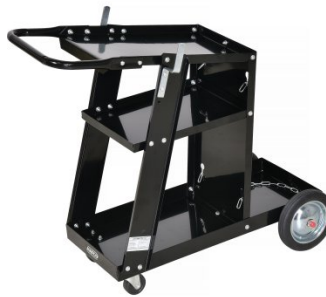
W241 Universal Welder Trolley