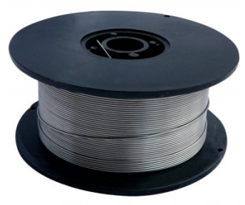
W1140G Ø0.8mm Gasless Mild Steel MIG Welding Wire