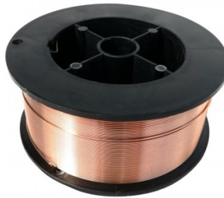
W1140L Ø1.2mm Mild Steel MIG Welding Wire