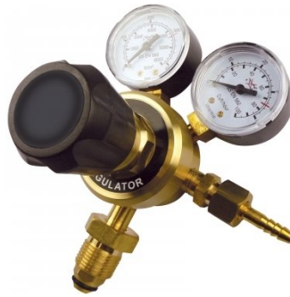
W1140D Argon Gas Regulator-Twin Gauge