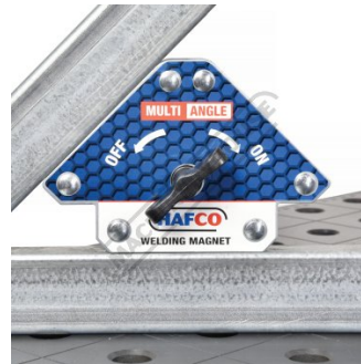
45 Degree Angle