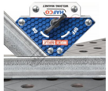
135 Degree Angle