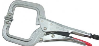
W112 Micro Welding Steel Clamp Set