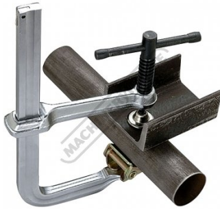
Clamping Steel Pipe