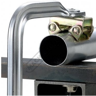
V Pad Jaw