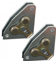
W1011 XYZ Magnet Squares - Multi-Angle - (2-Pack)