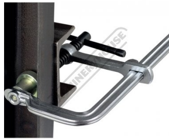
With Extender Block Jaw