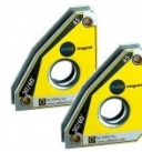
W1009 Mini Magnet Squares - (2-Pack)