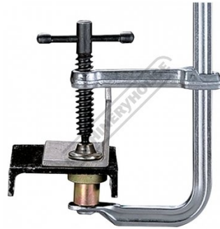
Clamping With Step Over