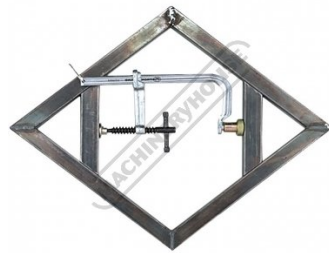
Shown As Spreader