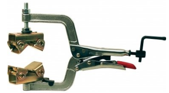
W1015 Pipe Plier