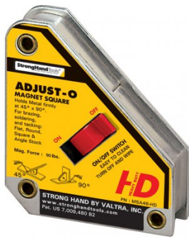
W1007 Adjust-O Magnet Square - Heavy Duty