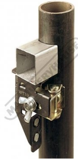
Square Tube Section On Pipe