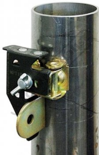
Parallel Tab On Square Tube