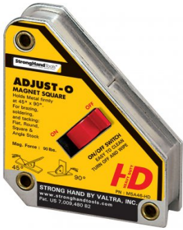
W1007 Adjust-O Magnet Square - Heavy Duty