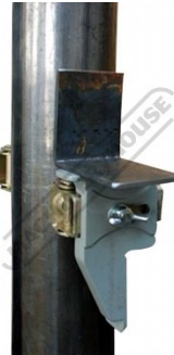
Angle Iron On Pipe