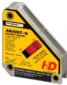
W1006 Adjust-O Magnet Square - Heavy Duty