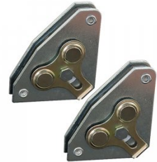
W1011 XYZ Magnet Squares - Multi-Angle - (2-Pack)