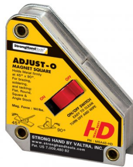
W1006 Adjust-O Magnet Square - Heavy Duty