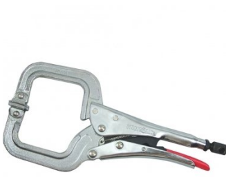
W112 Micro Welding Steel Clamp Set