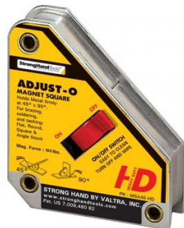
W1006 Adjust-O Magnet Square - Heavy Duty