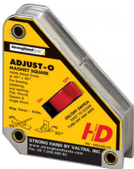
W1007 Adjust-O Magnet Square - Heavy Duty