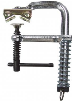
W07971 BuildPro Magspring Clamp