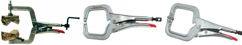
W1017 Locking C-Clamp - Swivel Tip