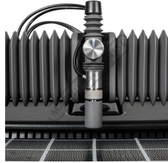
Cutting Head Inside Front View