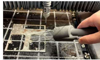
Wazer Pro Water Nozzle