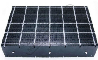
Single Cut Bed