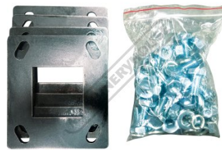
Wheel Bracket Kit