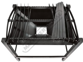
Pull Out Disposable Ribs