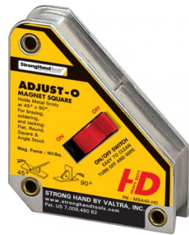
W1006 Adjust-O Magnet Square - Heavy Duty