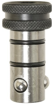
W07891 Ball Lock Pin 16 x 24mm