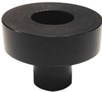
W08012 BuildPro V-Block Spacer