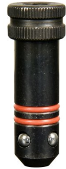
W07893 Ball Lock Pin 16 x 36mm