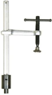
W07832 Welding Table Clamp