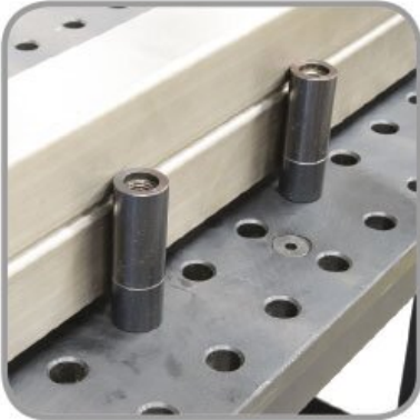
Optional Risers (W08515) screw directly into Adaptors for increased height.