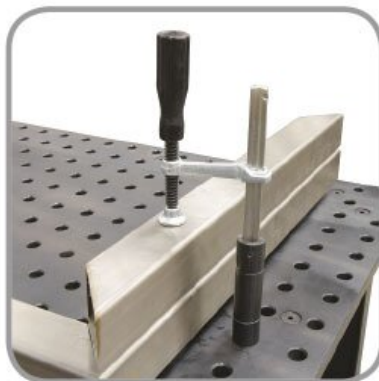
Optional SC-60 Clamps (W08510) & Risers (W08515) screw directly into adaptors for increased clamp height.