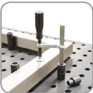
Optional SC-60 Clamps (W08510) screw directly into adaptors for quick position clamping.