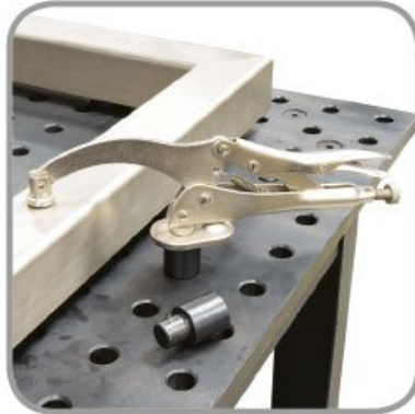
Optional Clamps (C103) screws into adaptors for quick position clamping.