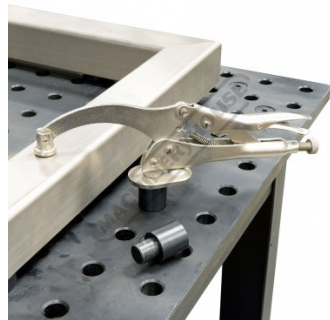
Optional Clamp C103 shown screwed into Threaded Riser