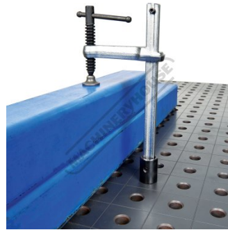
Shown Clamping 2 Lengths of Square Tube