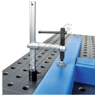
Shown Clamping Square Tube