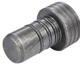
3 x O Rings