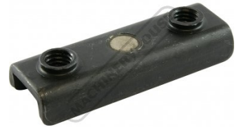
4 x Threaded Magnetic Adaptor