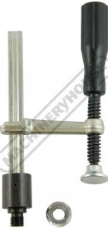
4 x Clamp