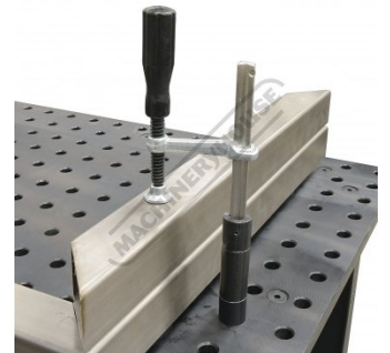
Shown Screwed into Threaded Riser with Optional Adaptor