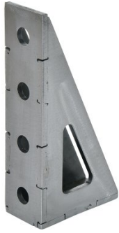
W08532 Welding Table Square