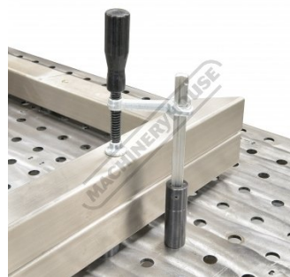
Shown Screwed into Threaded Riser