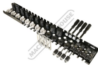
Shown on Optional Tool Tray (W08524)