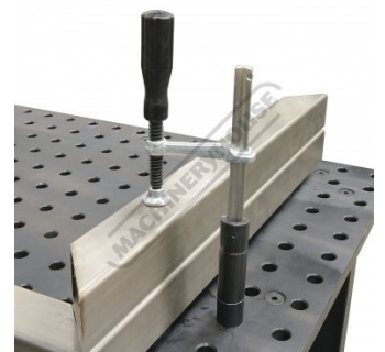
Shown Screwed into Threaded Riser with Optional Adaptor