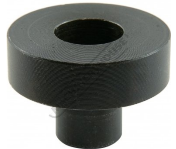
4 x V Spacer