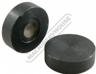
8 x Magnetic Rest