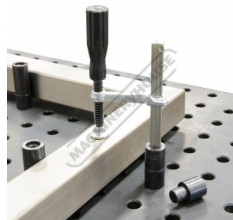
Shown Screwed into Optional Adaptor View2