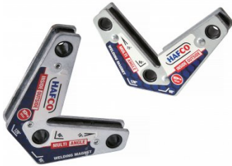
W1082 Multi Angle Corner Magnets - 2pc Pack