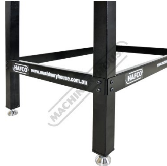
Steel Leg Bracing with Adjustable Feet