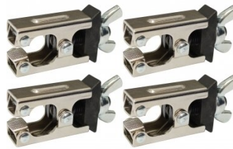
W112 Micro Welding Steel Clamp Set