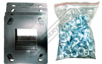
Includes Base Plate Kit for Optional Castor Wheels