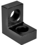
W08320 Right Angle Bracket / Stop