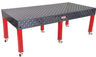
W08260 3000 x 1500mm M28 Pro Series Welding Table