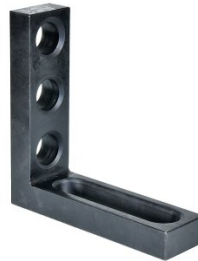
W08324 Right Angle Bracket / Stop