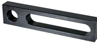
W08342 Straight Bar Stop