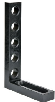
W08325 Right Angle Bracket / Stop