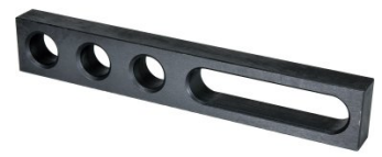
W08343 Straight Bar Stop