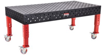
W08257 2400 x 1200mm M28 Pro Series Welding Table