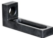
W08321 Right Angle Bracket / Stop