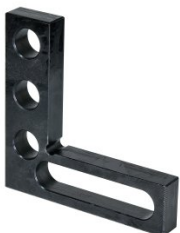
W08330 L Bracket