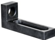
W08321 Right Angle Bracket / Stop