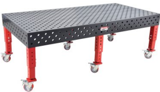
W08260 3000 x 1500mm M28 Pro Series Welding Table