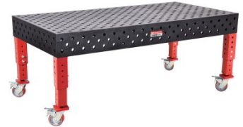
W08257 2400 x 1200mm M28 Pro Series Welding Table