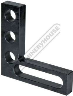
175x175x25mm L Brackets