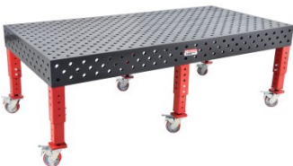
W08260 3000 x 1500mm M28 Pro Series Welding Table