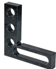
W08330 L Bracket