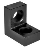
W08320 Right Angle Bracket / Stop