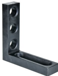
W08324 Right Angle Bracket / Stop