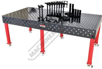
Shown on M28 Pro Series Welding Table