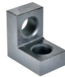
W08320 Angle Bracket / Stop