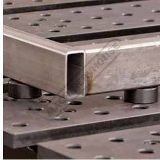
Use the Magnetic Rest Button to elevate workpieces above the tabletop