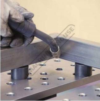
Rare Earth Disc Magnet on the bottom of the Rest Button allows placement at any point on the BuildPro Table