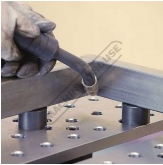
Rare Earth Disc Magnet on the bottom of the Rest Button allows placement at any point on the BuildPro Table