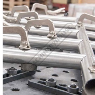
The Versatile V Blocks can stop clamp support or elevate round stock