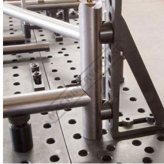
Can be used in combination with the Right Angle Brackets to hold locate or stop round stock