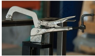
Use with Clamping Squares