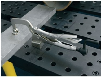
Rapid Lock and Release Ideal for Repetitious Clamping