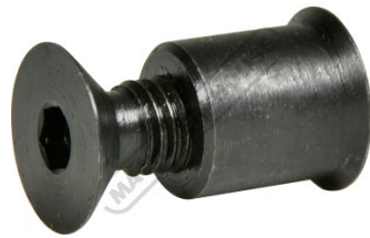
Hex Key Lock