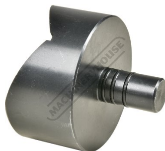
16mm Diameter Shank