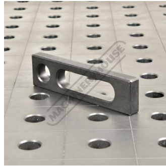
Shown on Welding Table