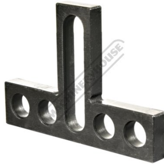
T Bracket 130 x 90 x 30mm