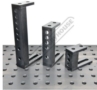
100mm 200mm 300mm Range Available