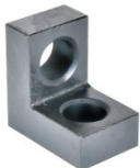
W08320 Angle Bracket / Stop