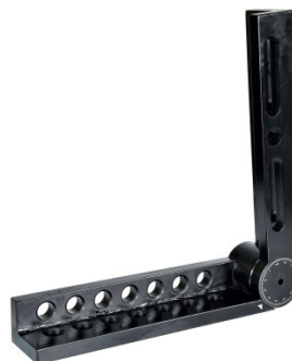
W08329 Adjustable Angle Bracket