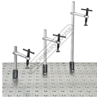
Optional Range Available