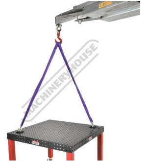
Shown Using Optional Lifting Kit