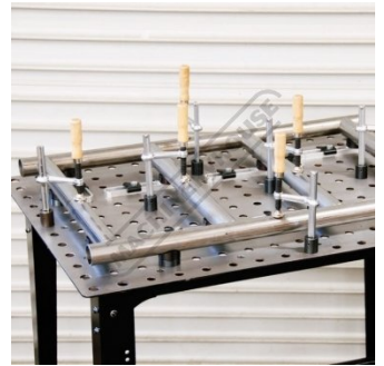
Shown with Optional Modular Fixturing Components for Round Tube