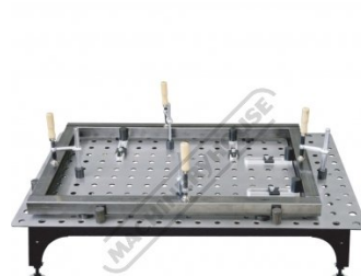
Shown with Optional Modular Fixturing Components for Square Tube 2