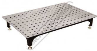
2nd Height Setting