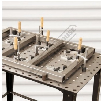
Shown with Optional Modular Fixturing Components for Square Tube